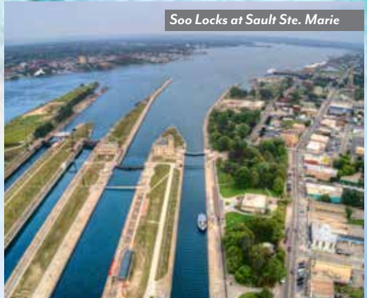
Soo Locks at Sault Ste. Marie

In the heart of North America lies the world's largest reservoir of fresh water, carved by glaciers 10,000 years ago. Surrounded by 11,000 miles of spectacularly sculpted shoreline, the five Great Lakes boast powerful natural wonders, historical maritime landmarks, and some of the greatest engineering feats of the 19 th century. Our tour offers a glimpse of life on the Great Lakes over the last two centuries as we visit the nearly 200-year-old Welland Canal that connects Lake Erie with Lake Ontario and the mighty Soo Locks—one located in Sault Ste. Marie in Ontario, Canada, and the other in a city by the same name in Michigan. Learn more about this fascinating maritime history at the SS VALLEY CAMP Museum, housed in a 1917 lake freighter, where two lifeboats from the famous EDMUND FITZGERALD shipwreck are on display.