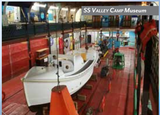
SS VALLEY CAMP Museum