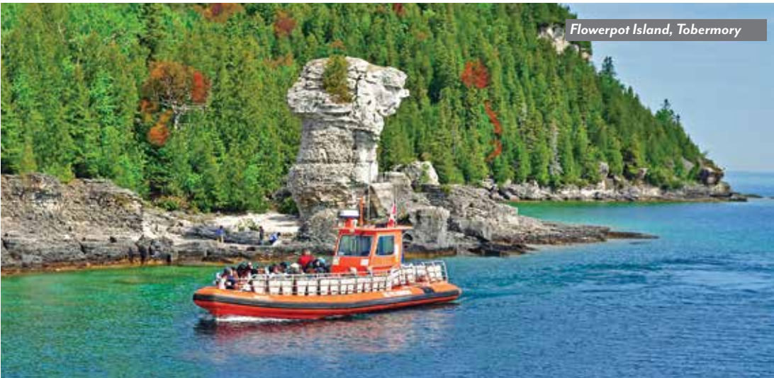
Flowerpot Island, Tobermory

Toronto, Canada/ Return to home city Day 8