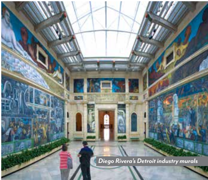
Diego Rivera's Detroit industry murals

Drive to Niagara Falls and ride the Hornblower Cruise